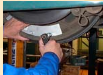
The universal absorber design enables a fast and simple mounting.